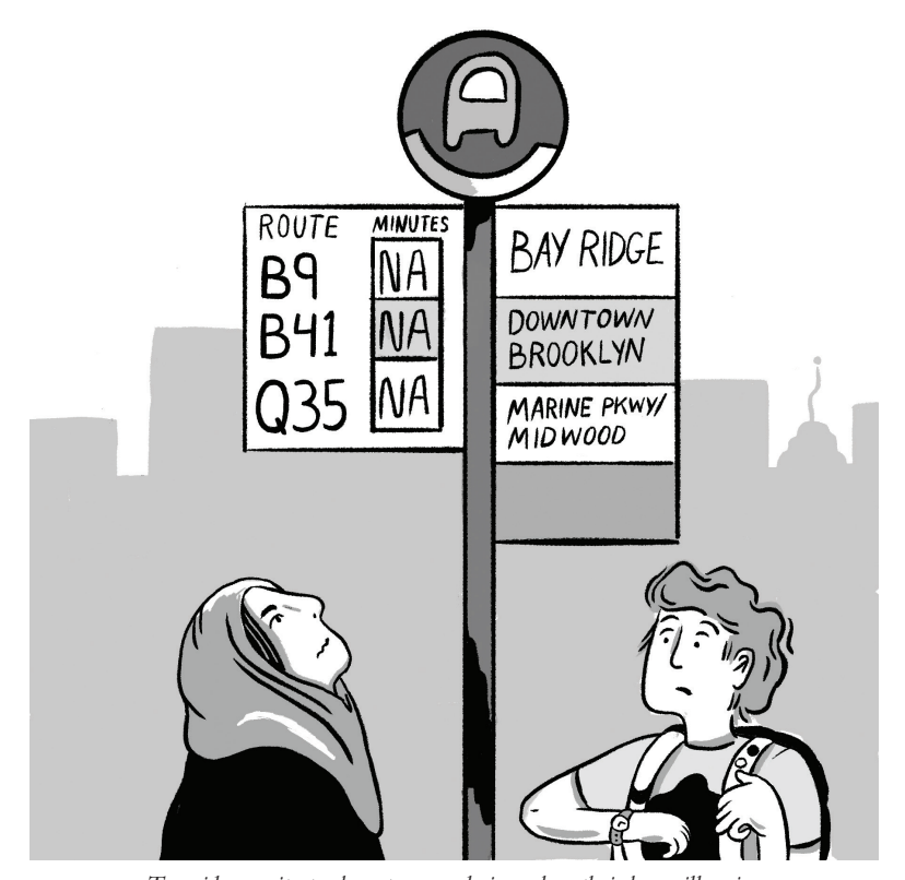
Two riders wait at a bus stop wondering when their bus will arrive.

rush, forcing me to use the N4 sometimes. The N4 has been more consistent throughout the day, even if it means walking an extra 15 minutes to cross the border to Nassau County to ride it. The most reliable option is the LIRR; however, its high cost is not conducive to use by lower and mid income riders, unless you can take advantage of deals like CityTicket or Atlantic Ticket. A regional rail network with fare parity and frequency increases with the subway would do a lot to help me travel throughout the city.