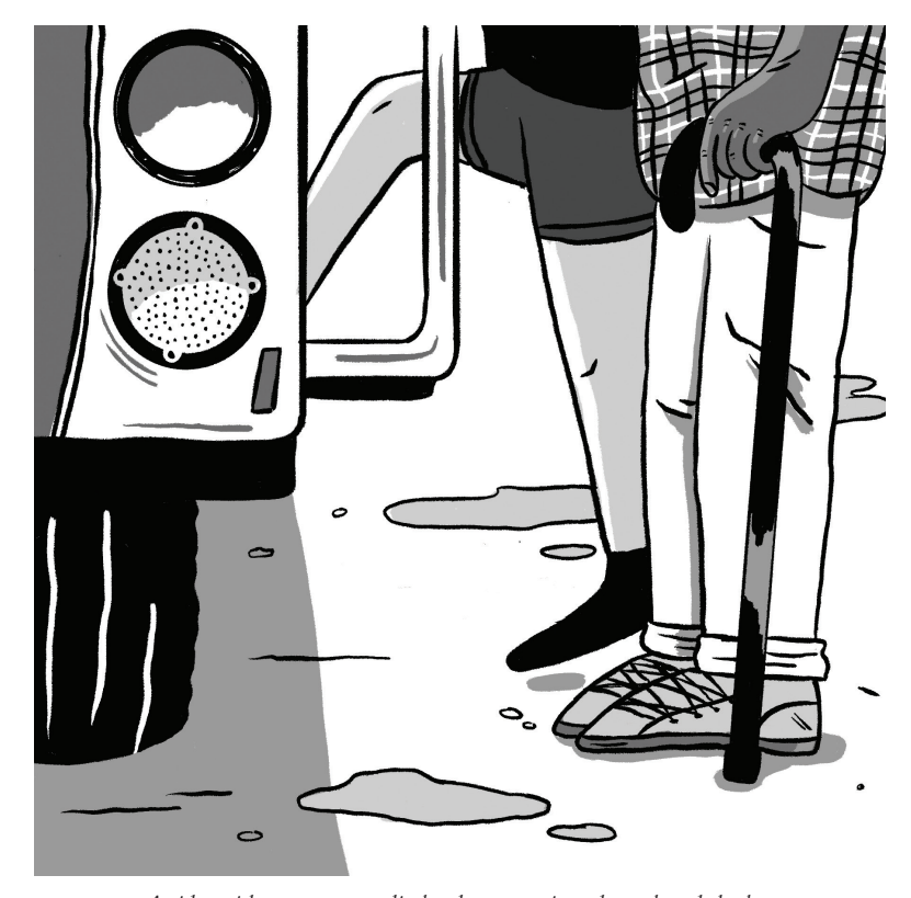
A rider with a cane must climb a large step in order to board the bus.

sun. What we really need if buses are crowded is more frequency, not an app! Nobody asks seniors or people with disabilities what they need.