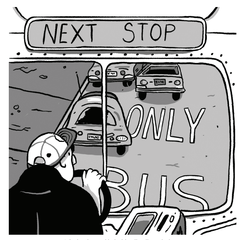
The bus lane is blocked by illegally parked cars.

I had to take three buses to work, and that costs $5.50 for each of us. That is frankly ridiculous, because why should the riders get shortchanged like that.