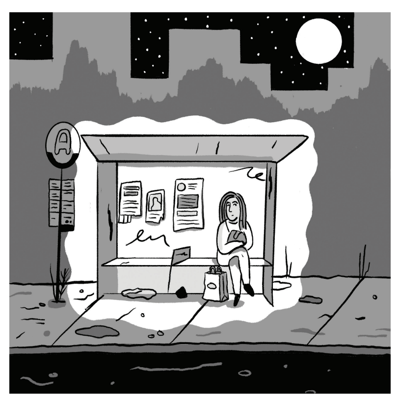
A rider waits for the bus alone late at night.

I like my job very much, I like my coworkers, I have been there for three years. I have seniority and benefits. Why should I give that up because of transit? In places like Queens and the Bronx, which have many service workers, the lack of fast and reliable and affordable transit is cutting off economic opportunity. We need a direct link to transportation and work centers like JFK and LaGuardia. For service workers like myself, getting to work on time is paramount, and we do not have extra money to take an Uber or a taxi when the bus doesn't come on time. We all fear losing our job over transit, which would be a travesty, as we all have bills we have to pay.