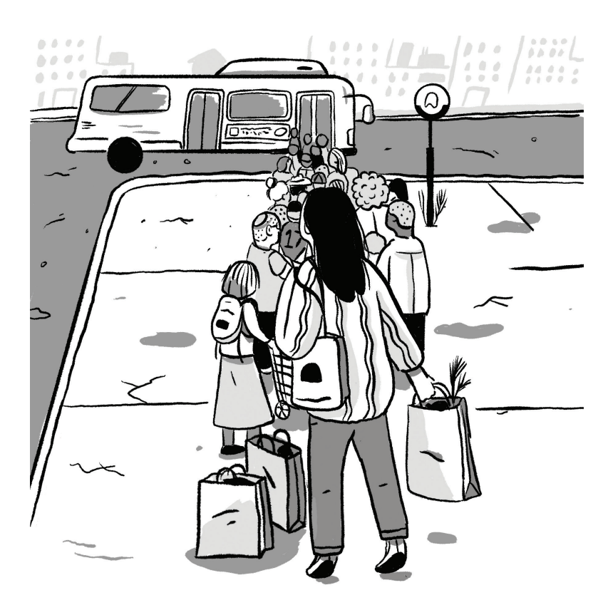
Riders must wait to board the bus, unable to enter through the back door.

I live in the Bronx, and take the Bx12. My bus is consistently busy and crammed full. The other day, three consecutive buses had to go out of service. This dumped hundreds of riders each time it happened, causing riders to force their way onto the next bus, which was already packed. This made my 20-minute journey 1 hour long. These journeys show how necessary maintenance and reliability is, and the importance of improving bus speeds. I would strongly recommend a busway on Fordham Road to support the large number of buses and riders that use this corridor.