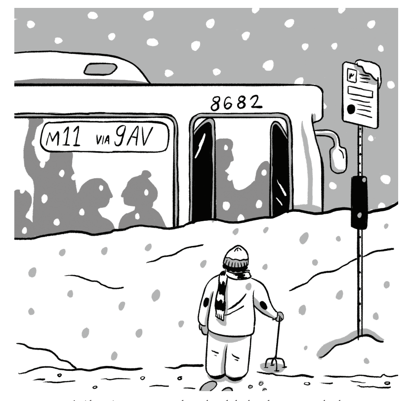
A rider using a cane struggles to board the bus due to a snowbank.

only had to take the bus to get to school. After most of my family died and we lost our home, I became homeless and had to learn the bus system to survive. I still rely on city buses daily to get around. I mostly take the Q4, Q5, Q85, Q84, Q20, Q44, and Q60. The medication I take makes me unsteady so I use a cane and most buses don't have seats for me to sit down. The front of the bus is so crowded I have to push my way through to the back. I am always afraid I will fall and hurt myself. I want more buses on routes and more reliability so that buses aren't as crowded.